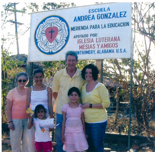
Founding Members in 2006!

Do you have experience with public relations, accounting, web design, marketing, or grant writing? We want you to join our volunteer team!. Whether you are a retired person who wants to make a difference, a graduate student looking for a project that will build a caring resume, or just an average Joe with a talent to share, we need your help! As Lunches for Learning continues to grow, so do the opportunities for people like you. People who know that they can make the world a better place, one child at a time. Call, email, or write us today. We look forward to working with you!